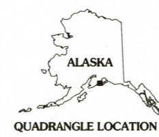
ALASKA QUADRANGLE LOCATION

CONTOUR INTERVAL 100 FEET NATIONAL GEODETIC VERTICAL DATUM OF 1929 THE MEAN RANGE OF TIDE IS APPROXIMATELY 10 FEET TO CONVERT FROM FEET TO METERS, MULTIPLY BY 0.3048