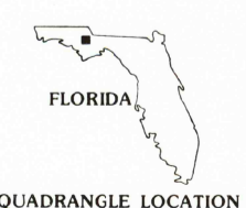
QUADRANGLE LOCATION CONTOURS AND ELEVATIONS IN METERS

THIS MAP COMPLIES WITH NATIONAL MAP ACCURACY STANDARDS FOR SALE BY U.S. GEOLOGICAL SURVEY, RESTON, VIRGINIA 22092 A FOLDER DESCRIBING TOPOGRAPHIC MAPS AND SYMBOLS IS AVAILABLE ON REQUEST