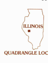
ILLINOIS QUADRANGLE LOCATION

THIS MAP COMPLIES WITH NATIONAL MAP ACCURACY STANDARDS FOR SALE BY U. S. GEOLOGICAL SURVEY, RESTON, VIRGINIA 22092 AND THE STATE GEOLOGICAL SURVEY, CHAMPAIGN, ILLINOIS 61820