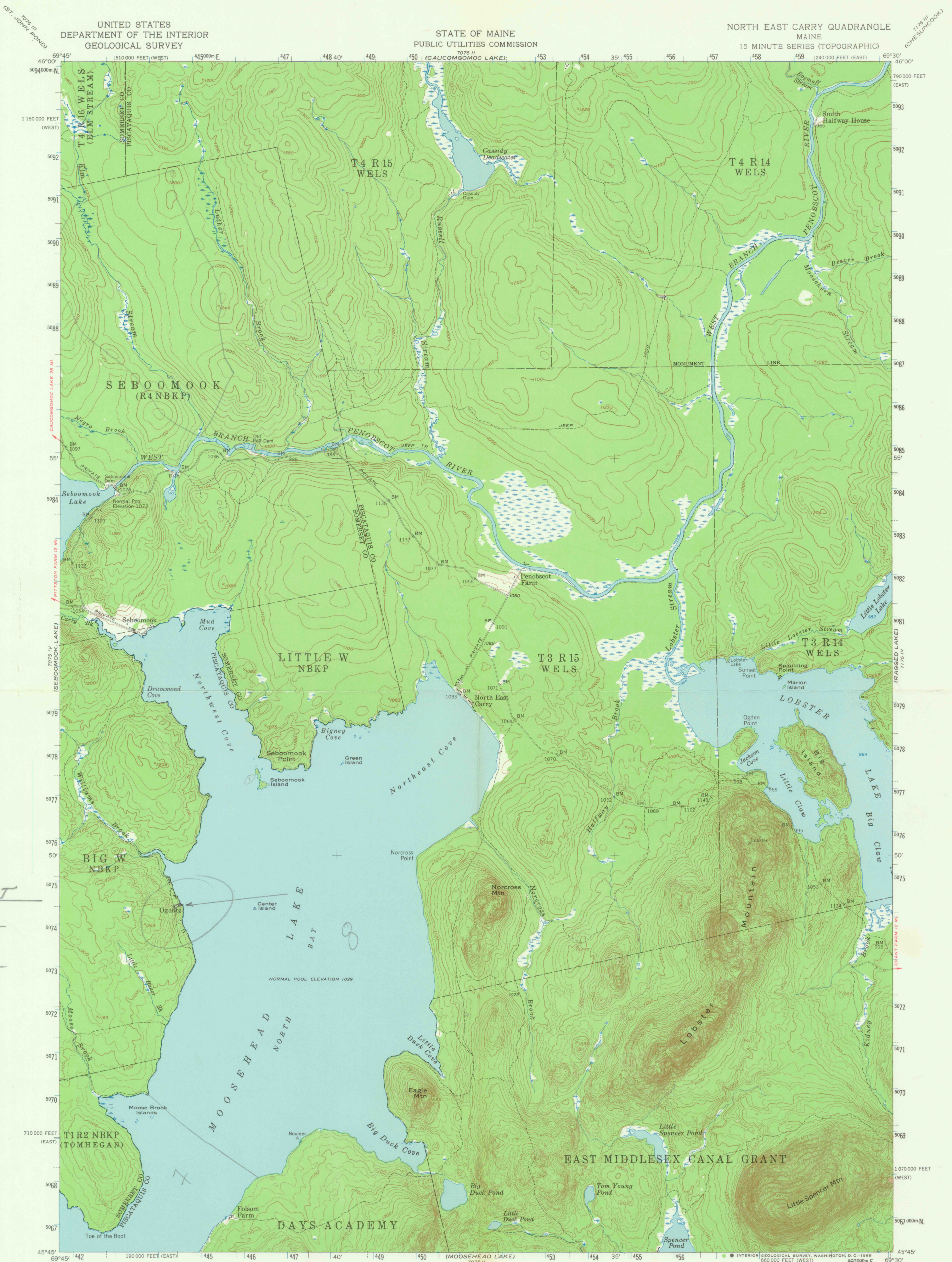
EXHIBIT H LURC #362

Mapped, edited, and published by the Geological Survey Control by USGS and USC&GS Topography from aerial photographs by multiplex methods Aerial photographs taken 1954. Field check 1954 Polyconic projection. 1927 North American datum 10,000-foot grid based on Maine coordinate system, east and west zones 1000-meter Universal Transverse Mercator grid ticks, zone 19, shown in blue Unchecked elevations are shown in brown