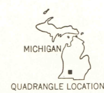
MICHIGAN QUADRANGLE LOCATION

BEDFORD, MICH. NW 4 BATTLE CREEK 15' QUADRANGLE N4222.5—W8507.5/7.5