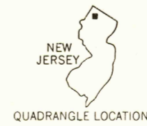
NEW JERSEY QUADRANGLE LOCATION