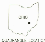
OHIO QUADRANGLE LOCATION

RINGGOLD, OHIO SW/4 MC CONNELLSVILLE 15' QUADRANGLE N3930—W8152 5/7.5 PHOTOINSPECTED 1984 1961 PHOTOREVISED 1975 AMS 4663 III SW—SERIES V852