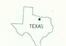
QUADRANGLE LOCATION 3397-313