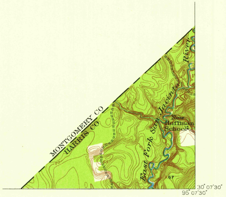
PRELIMINARY EDITION UNSURVEYED AREA