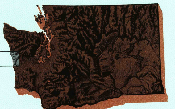
30 X 60 MINUTE QUADRANGLE