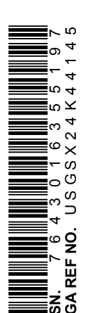
TABLE MOUNTAIN, AZ 2018

Check with local Forest Service unit for current travel conditions and restrictions.