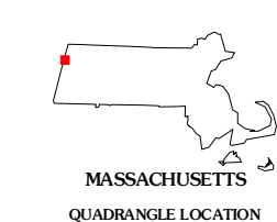
MASSACHUSETTS QUADRANGLE LOCATION

SCALE 1:24 000 CONTOUR INTERVAL 20 FEET NORTH AMERICAN VERTICAL DATUM OF 1988 This map was produced to conform with the National Geospatial Program US Topo Product Standard, 2011. A metadata file associated with this product is draft version 0.6.1