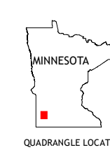
MINNESOTA QUADRANGLE LOCATION