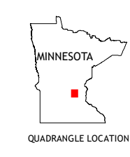
MINNESOTA QUADRANGLE LOCATION