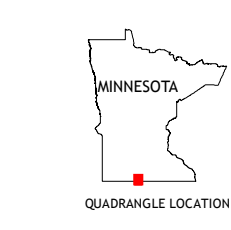
MINNESOTA QUADRANGLE LOCATION