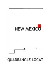
NEW MEXICO QUADRANGLE LOCATION

This map was produced to conform with the National Geospatial Program US Topo Product Standard, 2011. A metadata file associated with this product is draft version 0.6.18