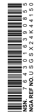
TABLE MOUNTAIN, OR 2024

Check with local Forest Service unit for current travel conditions and restrictions.