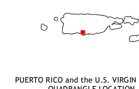
PUERTO RICO and the U.S. VIRGIN ISLANDS QUADRANGLE LOCATION

This map was produced to conform with the National Geospatial Program US Topo Product Standard, 2011. A metadata file associated with this product is draft version 0.6.13