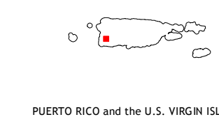
PUERTO RICO and the U.S. VIRGIN ISLANDS QUADRANGLE LOCATION

CONTOUR INTERVAL 30 FEET DATUM IS LOCAL MEAN SEA LEVEL This map was produced to conform with the National Geospatial Program US Topo Product Standard, 2011. A metadata file associated with this product is draft version 0.6.13